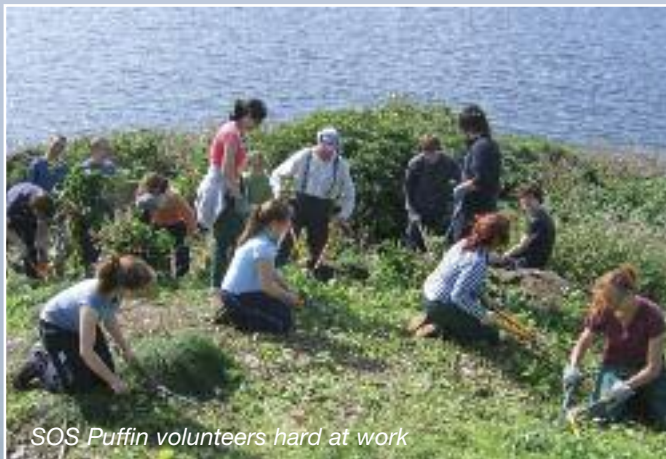
SOS Puffin volunteers hard at work

Craigleith has a five year management plan; this suggests that eliminating tree mallow entirely is very unlikely; rather the hope is, it can be contained with relatively little ongoing management.