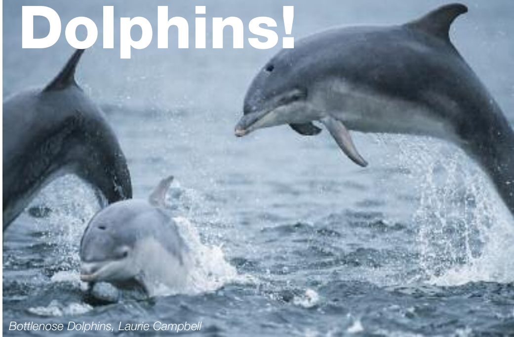
Bottlenose Dolphins, Laurie Campbell

There have been an unusually large number of sightings of dolphins this summer in the Firth of Forth. The sightings have included reports of very large groups of up to 75 dolphins.