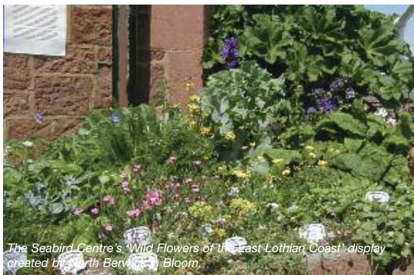
The Seabird Centre's 'Wild Flowers of the East Lothian Coast' display created by North Berwick in Bloom.

Sheila Sinclair, Secretary of the North Berwick in Bloom team behind the bid said, "We are very, very pleased to have won. We worked very hard. Quite honestly we couldn't have done more. It's good for tourism and it's good for people to work together to make the place nicer for everyone to live in."